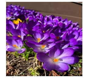
Spring flowers are starting to bloom